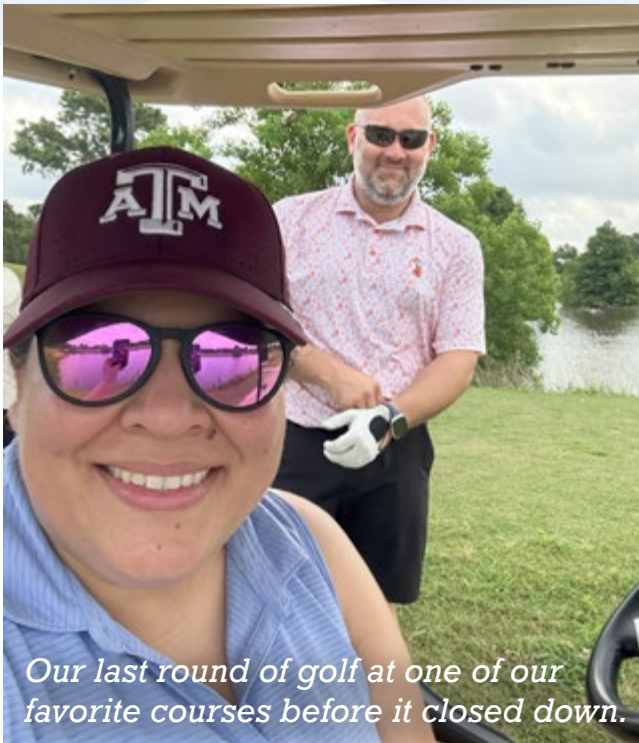
Our last round of golf at one of our favorite courses before it closed down.

W e share a love for staying active, celebrating life's moments, and making lasting memories. One of our favorite hobbies is golf, something we picked up as adults and have completely fallen in love with. We enjoy the challenge of improving each time we play and hope to pass that love down to future children. Golf teaches so many great life lessons like perseverance, patience, and determination and we can't wait to share those moments as a family one day.