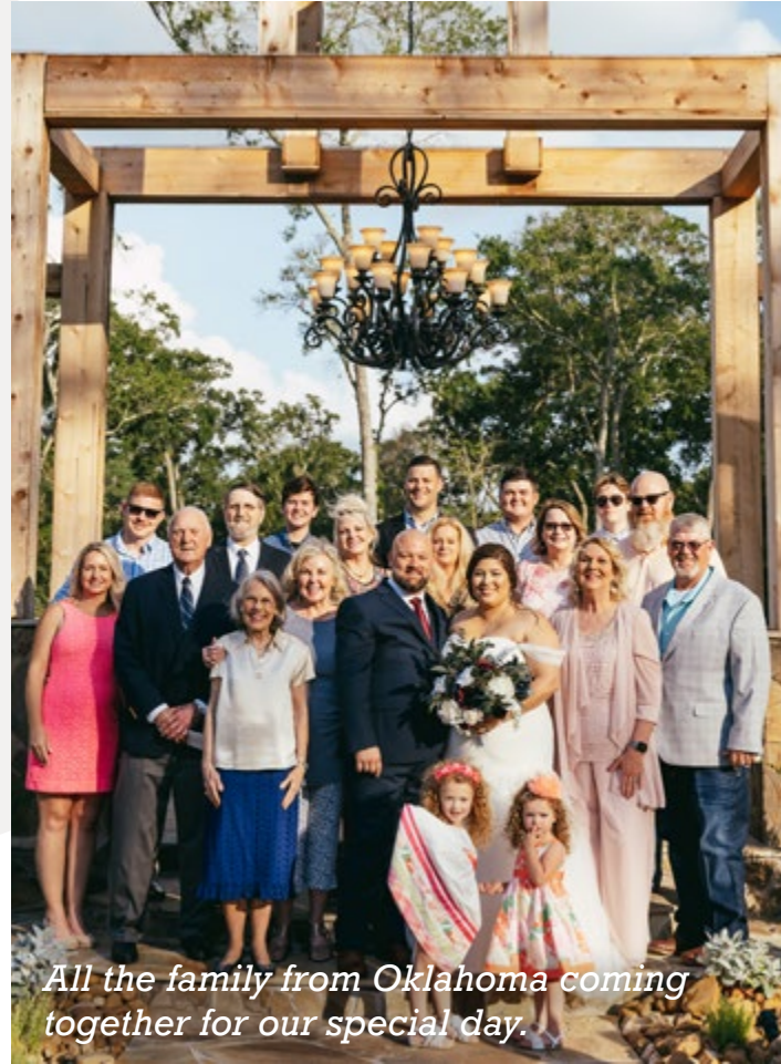
All the family from Oklahoma coming together for our special day.

We each have three siblings, which means our family is full of energy, laughter, and love—and it's still growing! Between us, we have five wonderful nieces and nephews, ranging from toddler to early elementary. They keep everyone entertained and have brought so much joy to our family. Some of our relatives live nearby, while others are a road trip away in places like Kansas.