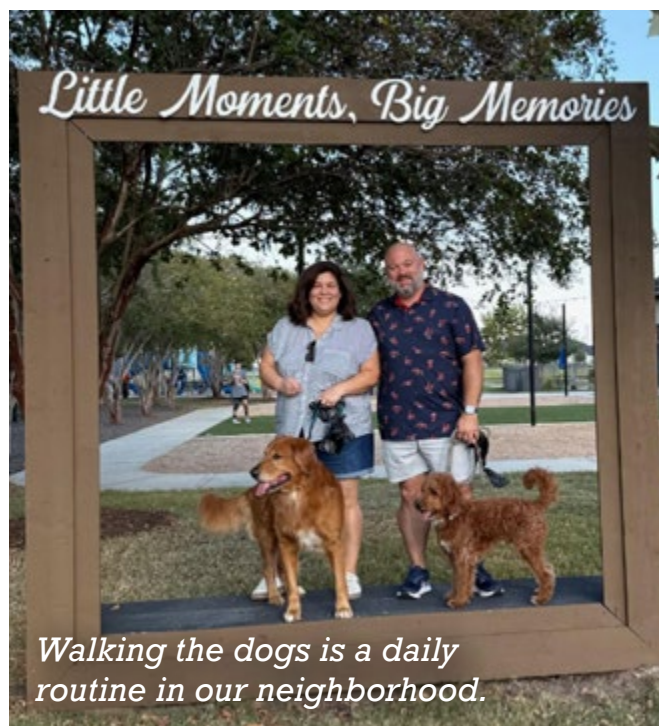
Walking the dogs is a daily routine in our neighborhood.

Located on a quiet cul-de-sac, our street is a perfect place for kids to safely play, and creates a warm and friendly environment where neighbors look out for one another. We're lucky to have great friends nearby and wonderful next-door neighbors who are always ready to lend a hand.