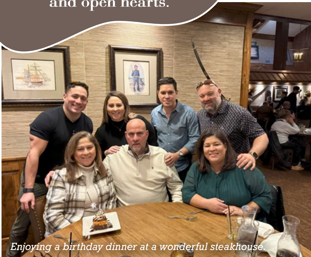
Enjoying a birthday dinner at a wonderful steakhouse.

Our families are incredibly supportive of our adoption journey and already excited to welcome a new little one with open arms and open hearts. We know a child will grow up surrounded by love, faith, and the unwavering support of both families.