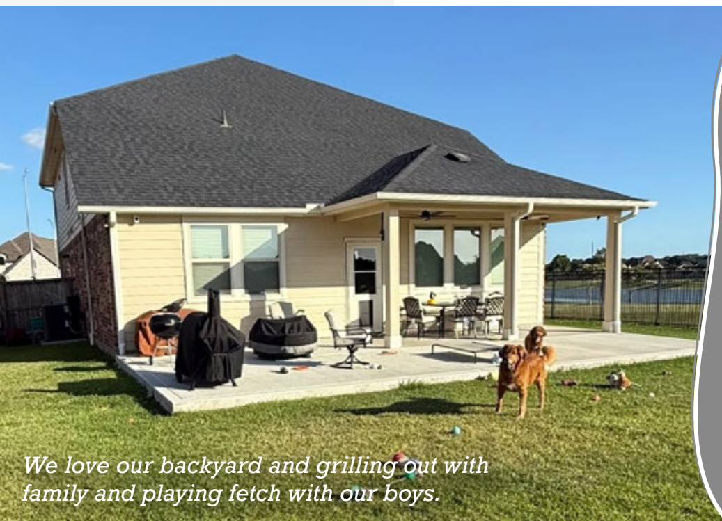
We love our backyard and grilling out with family and playing fetch with our boys.