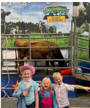
Learning about dairy farming at the rodeo.