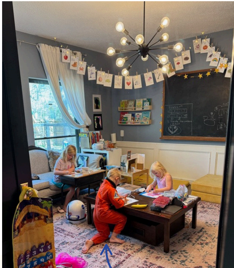
Our school room