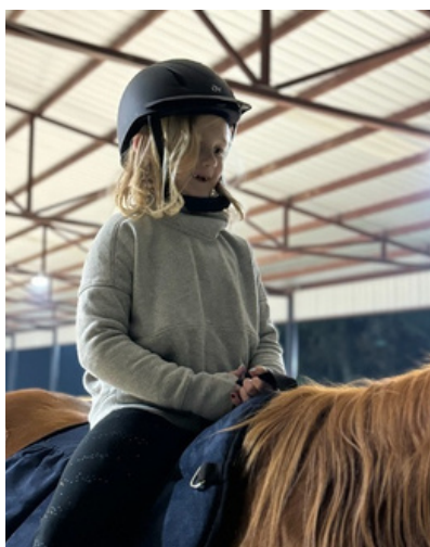
Horseback riding lesson