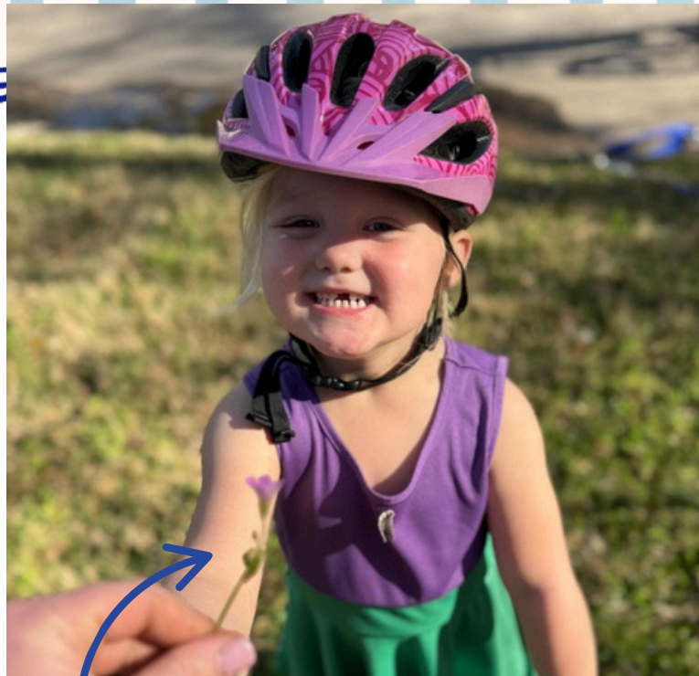
flowers for Mommy