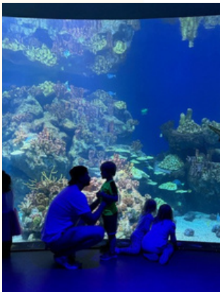
Houston zoo with Dad