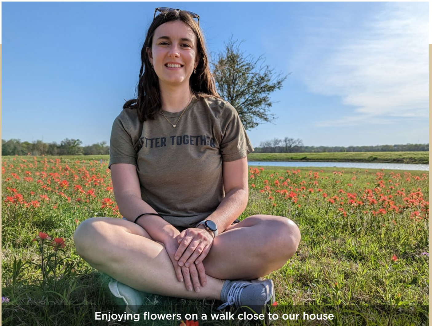
Enjoying flowers on a walk close to our house