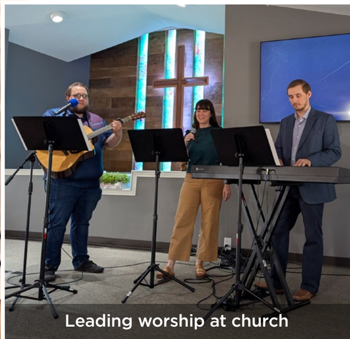
Leading worship at church