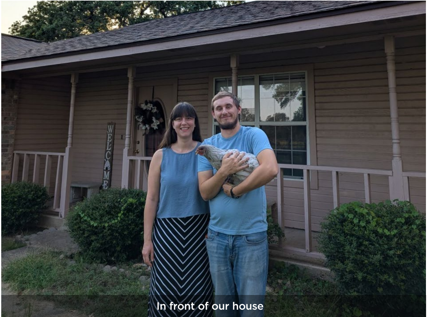
In front of our house