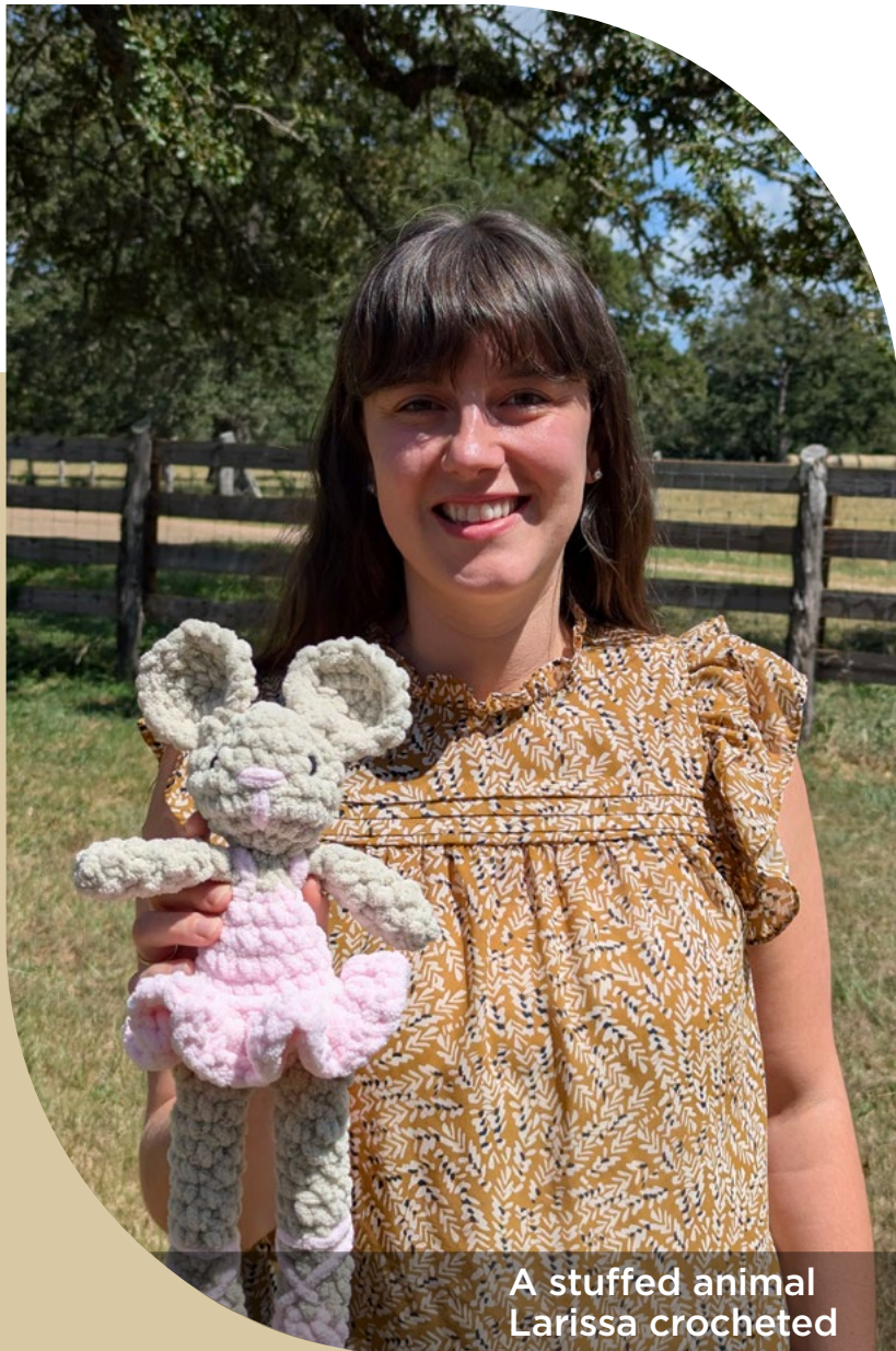
A stuffed animal Larissa crocheted