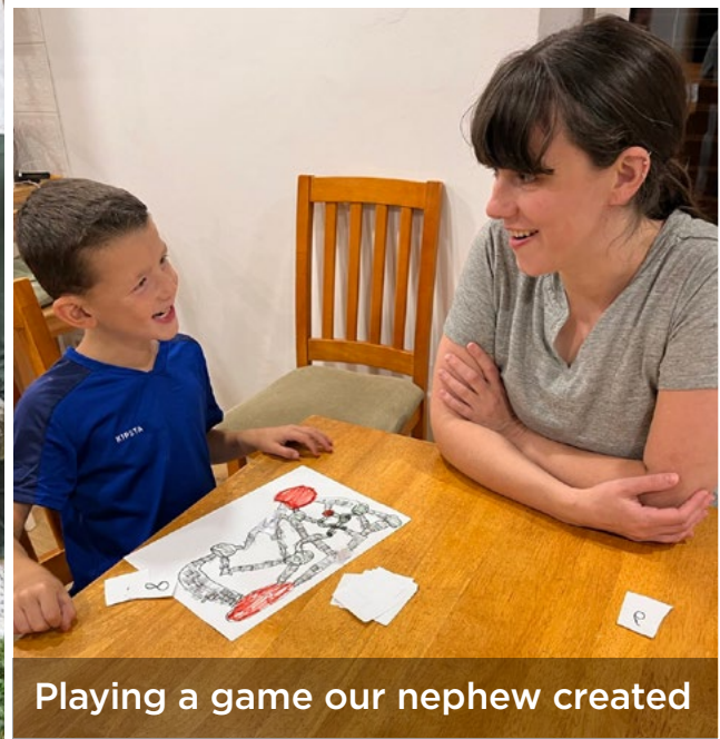
Playing a game our nephew created