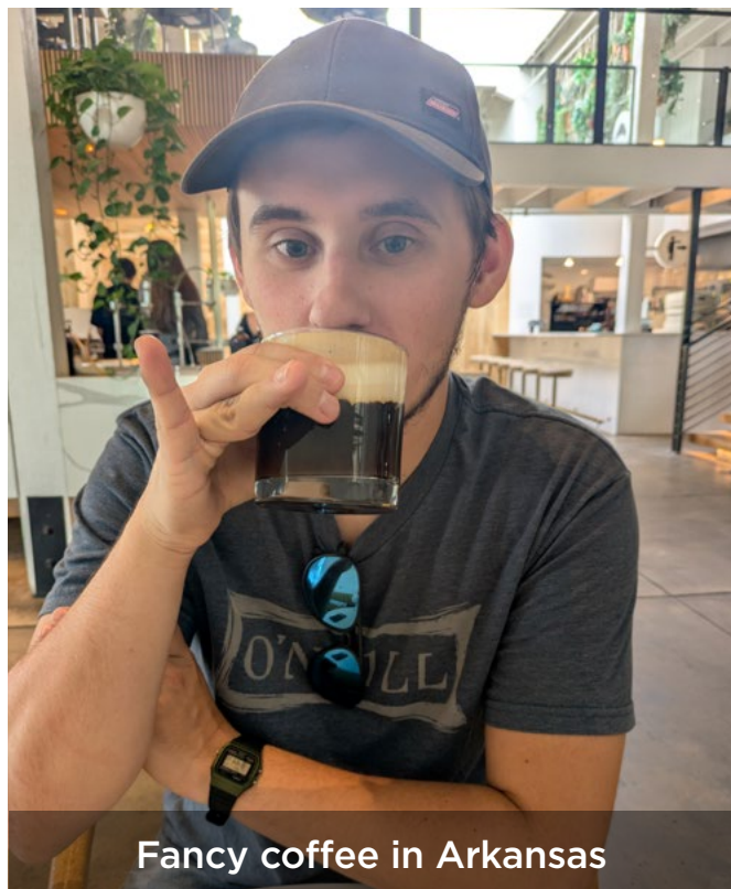
Fancy coffee in Arkansas