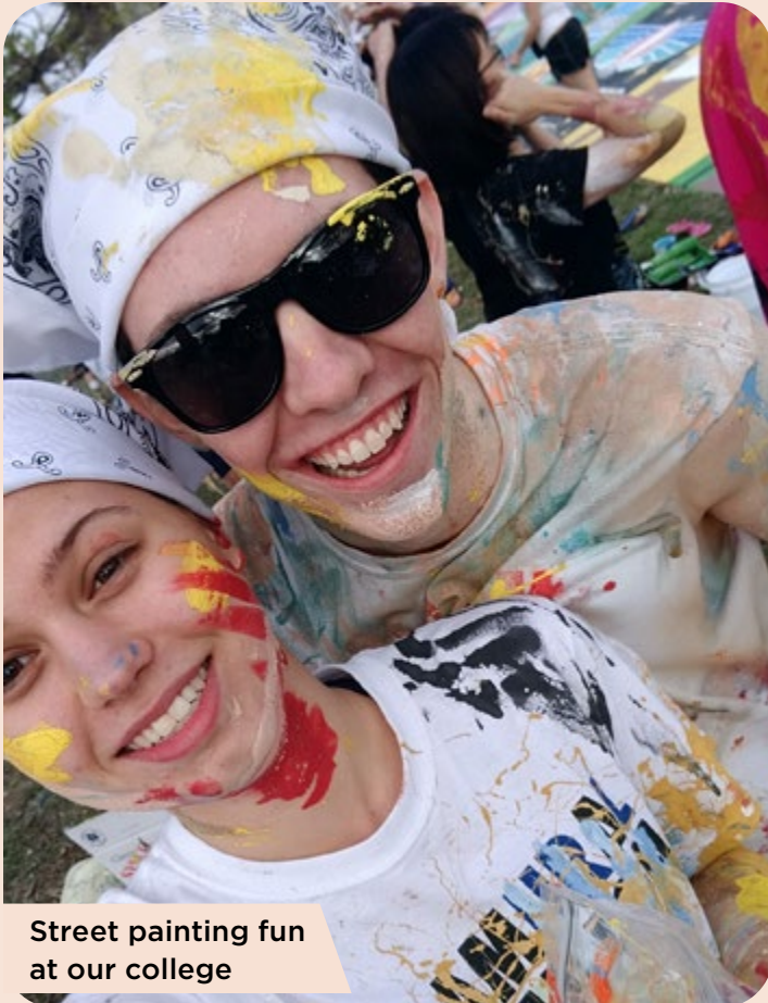
Street painting fun at our college