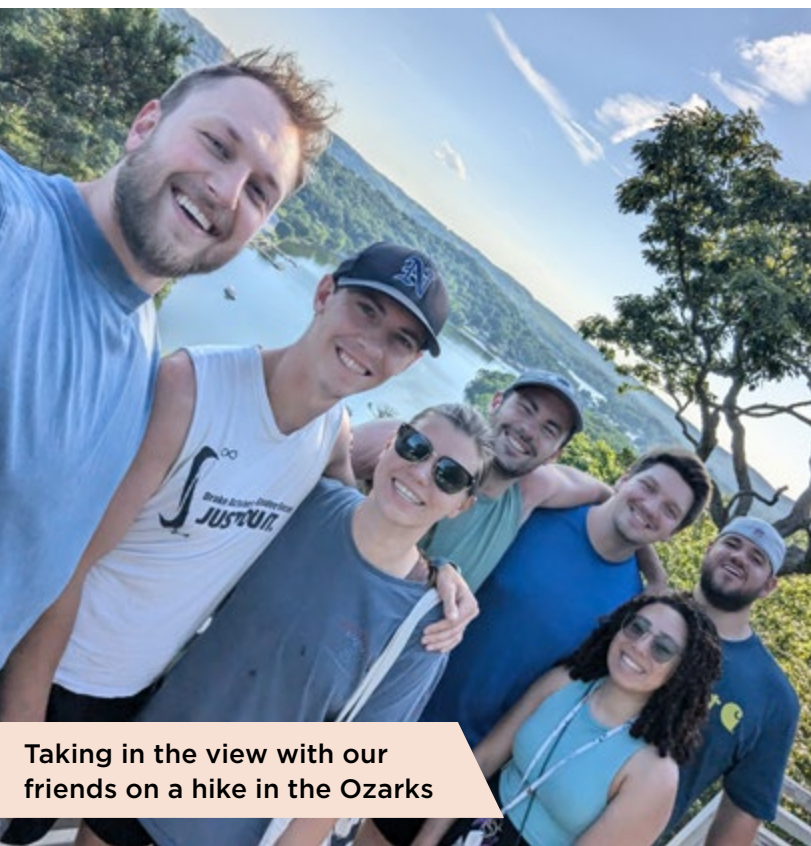
Taking in the view with our friends on a hike in the Ozarks

Outside of our church and community involvement, we both enjoy quiet hobbies that pair well together. While Noah practices the drums, you might find Cassie crocheting at her desk while watching videos. Other times, you'll see us in the garden caring for our fruits and vegetables. Cassie especially enjoys coming up with creative ways to preserve our harvest—from homemade pickles and strawberry preserves to spicy salsa and countless delicious side dishes!