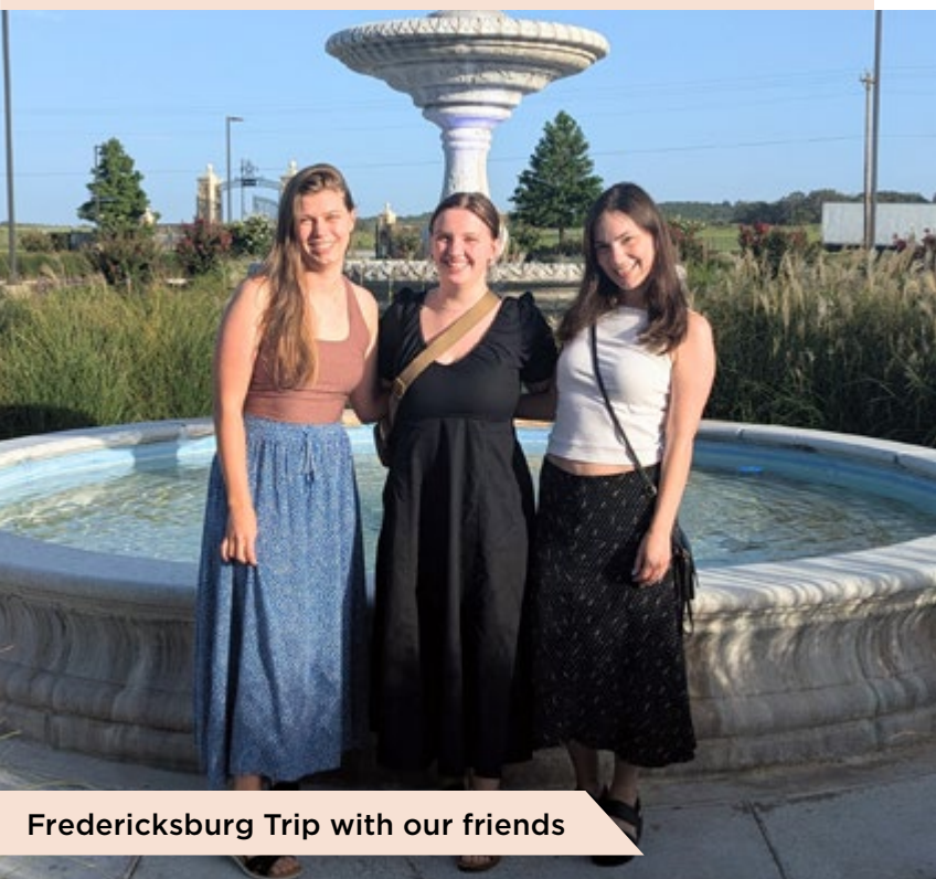
Fredericksburg Trip with our friends

She's become a great inspiration to me as I've seen her go from non-believer to a woman of God. She loves to journal, read, and highlight through her bible during her studies. She's a great partner in prayer, helping me to be more like her in each of these ways. I couldn't ask for a better person to spend my life with, and I know she will be an amazing mother.