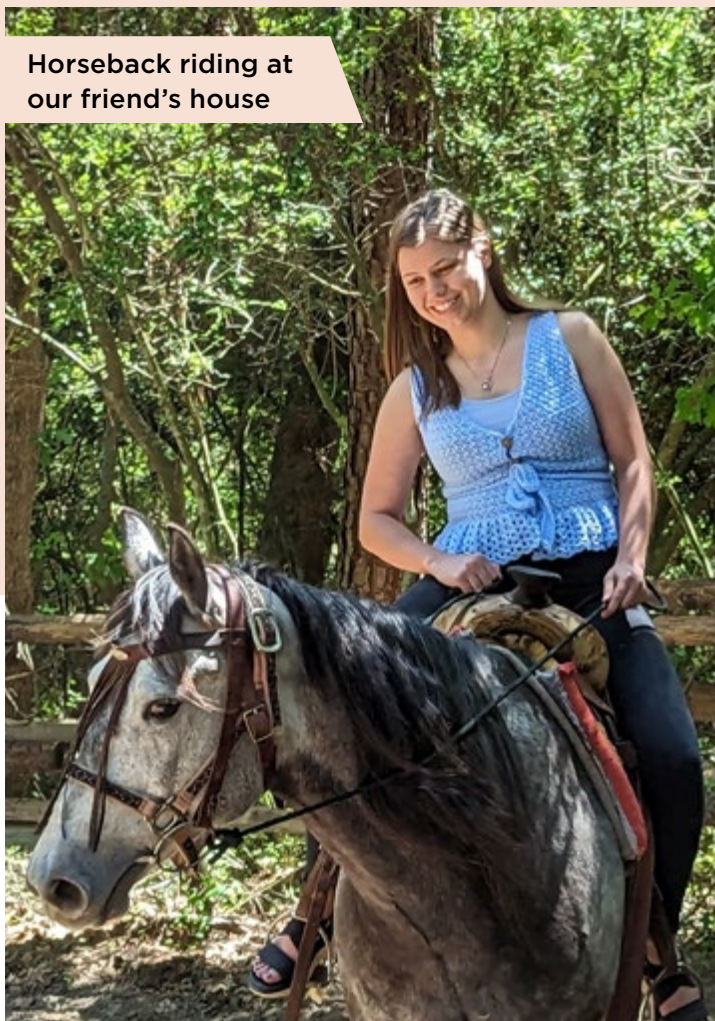
Horseback riding at our friend's house