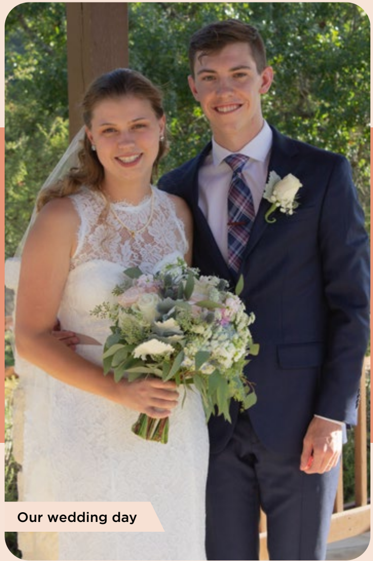
Our wedding day

Thank you so much for taking time to learn about us!