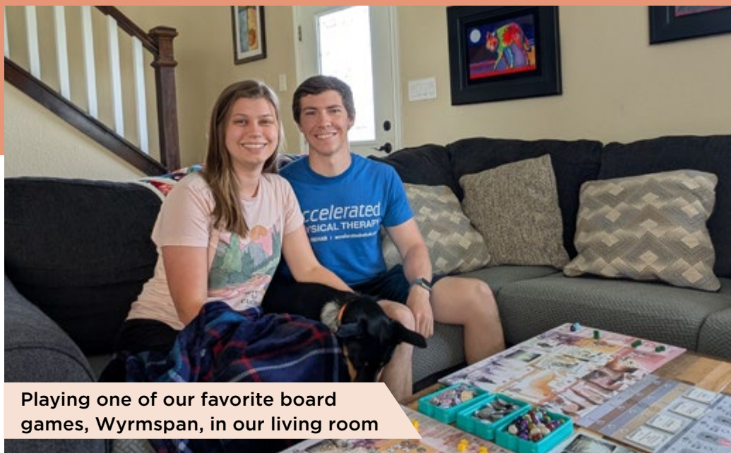
Playing one of our favorite board games, Wyrmspan, in our living room

Though we haven't lived here long, we've already built deep connections in our small town. Moving somewhere where we didn't know anyone was certainly nerve-racking—but God truly provides. We quickly found a community through our church and formed lasting friendships with people of all ages. We feel incredibly blessed to have found such a loving, welcoming community that has embraced us like family.