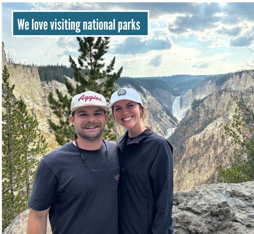
We love visiting national parks

Our faith in Jesus is extremely important to us. It is the foundation of our marriage and family, and we promise to share the love of Christ with the child. It is important for us to grow in our faith both individually and together. We are very involved in our church and other ministries by participating in small groups and Bible studies and leading serve teams. Our faith gives us hope in all areas of our lives, and we do our best to be like Jesus!