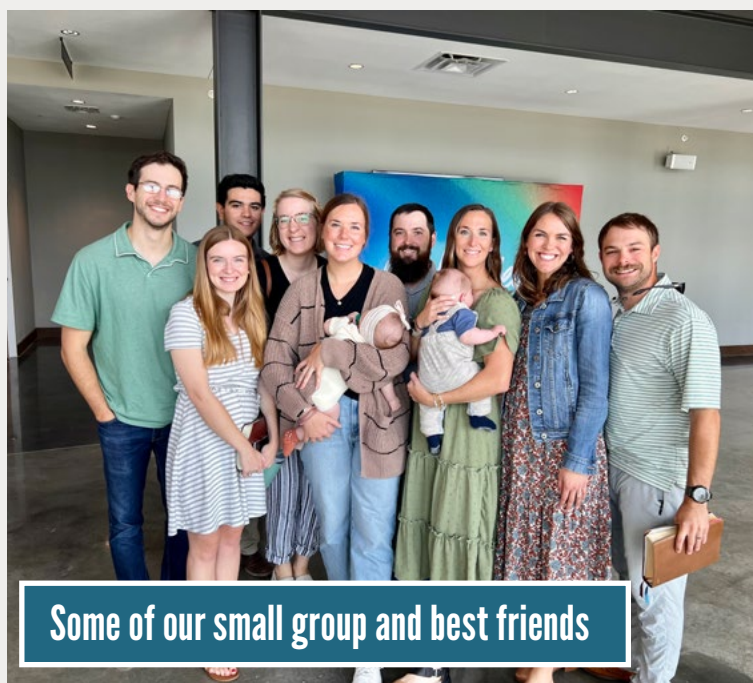
Some of our small group and best friends

We have an amazing support system and a community of people who care for us deeply. They have been praying over a future child for so long and will be very excited to meet and love on them! The child will be welcomed into a wonderful crew of grandparents, aunts, uncles, cousins, lots of extended family, and many dear friends, both near and far, who feel like family.