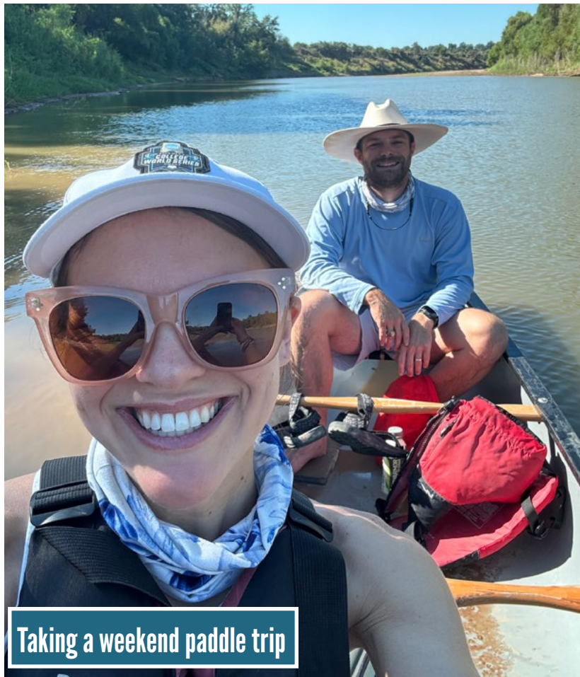
Taking a weekend paddle trip

We have a balanced lifestyle of hard work, play, and rest. We love to be active, whether it's being outdoors, completing a project together, going to a sporting event, or exploring a new area, but we always make time for and enjoy a casual day at home, too. We do our best to use our time purposefully, invest in people, and enjoy the wonderful life we've been given!