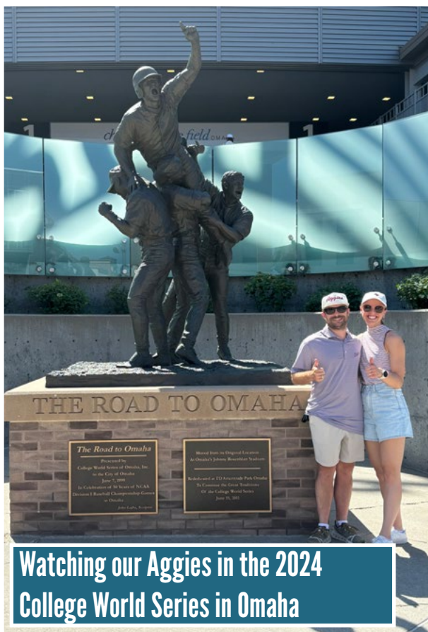
Watching our Aggies in the 2024 College World Series in Omaha