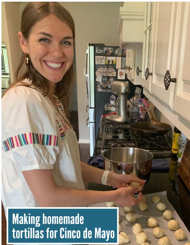
Making homemade tortillas for Cinco de Mayo

Our home is welcoming, clean, cozy, and bright. We love hosting and inviting friends and family over, and there is a large backyard with lots of room to play. Our back patio is a fun place to gather, play darts and yard games, and wind down in the evening while appreciating the beautiful sunsets we see from our porch. Our other favorite room in the house is our spacious kitchen. We both love to cook, and we enjoy making and sharing a meal together.