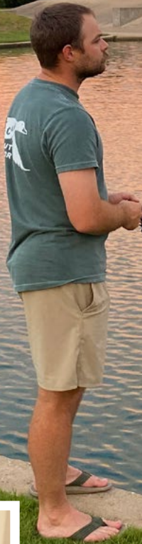
Fishing at the neighborhood ponds