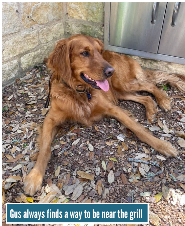
Gus always finds a way to be near the grill

Gus, our precious pup, brings so much joy and laughter to our home! He is a golden retriever who was born in 2019, and he is affectionate, silly, and full of energy. Gus adores kids and will be so excited to welcome home a new buddy to play with and snuggle.