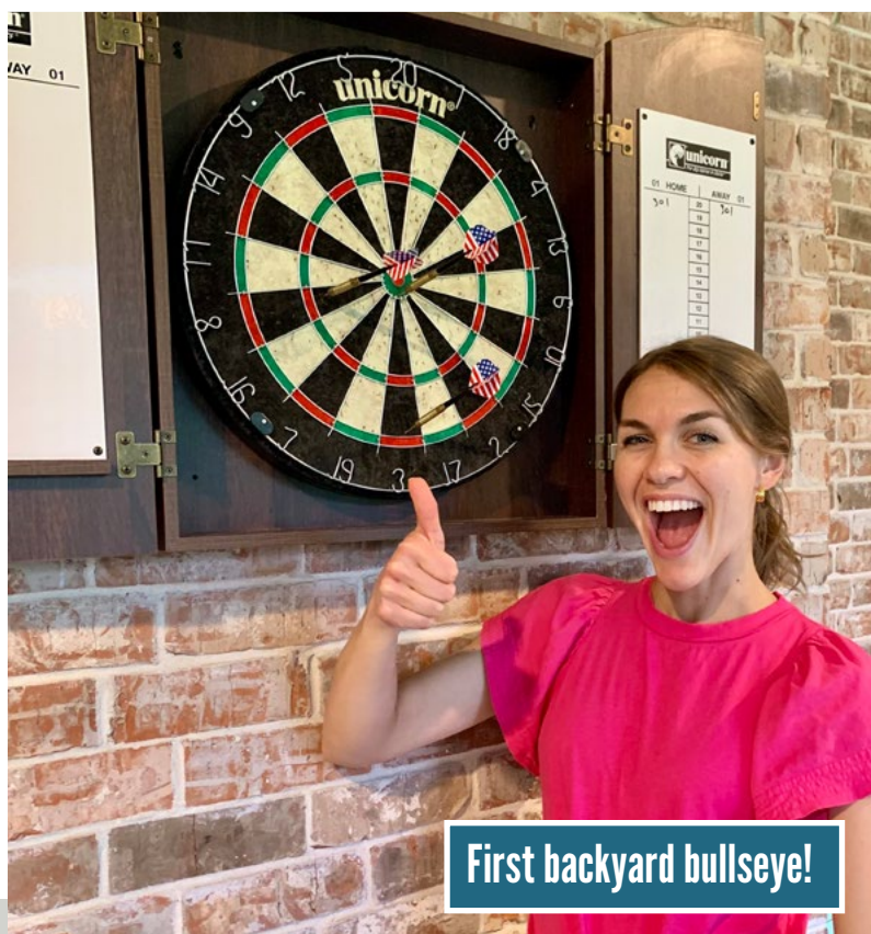
First backyard bullseye!