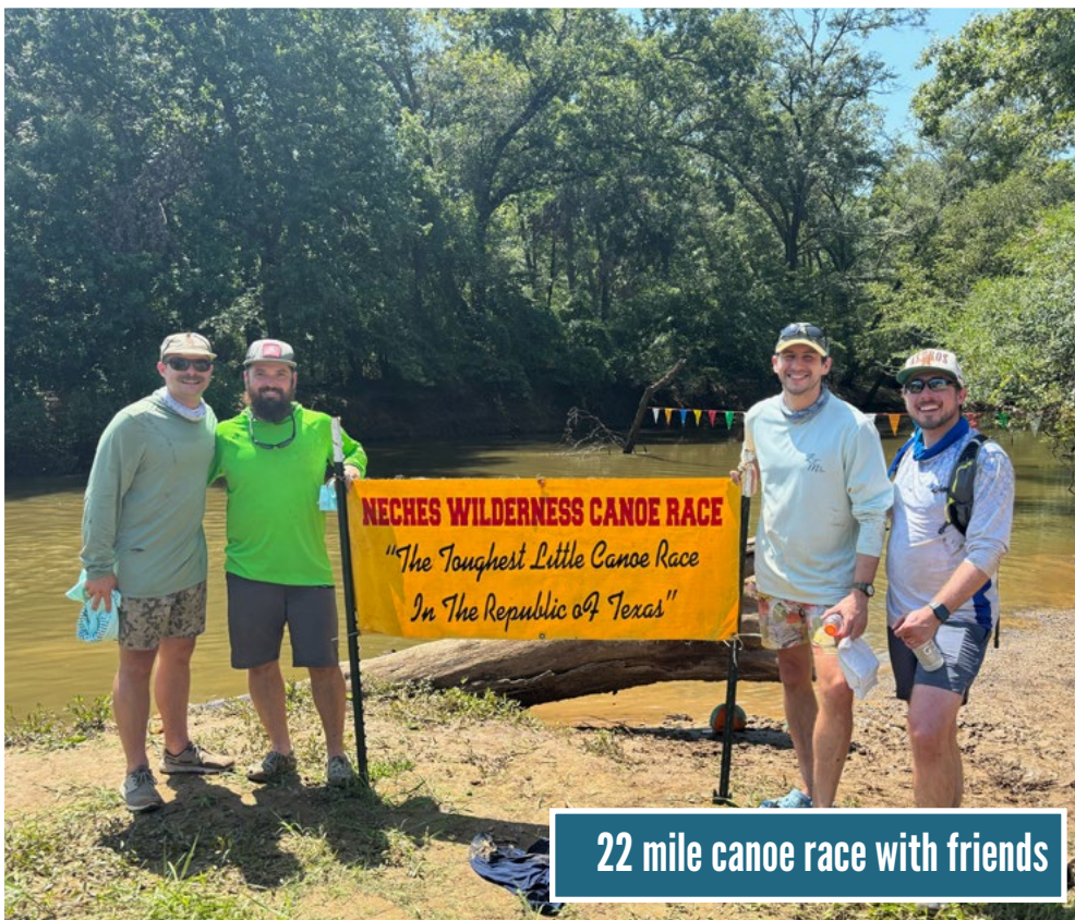
22 mile canoe race with friends