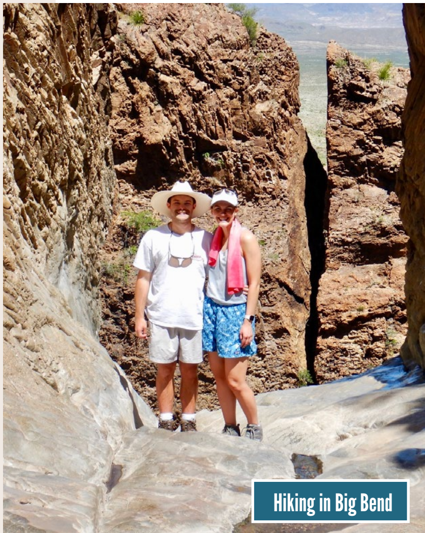
Hiking in Big Bend